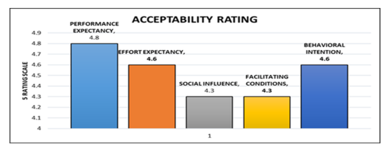
Figure 1: Summary Graph of Acceptability Rating of Using Led TV in the Classroom Verbal Interpretation of Acceptability Rating (5- Strongly Agree, 4- Agree, 3-Neutral, 2-Disagree, 1-Strongly Disagree)