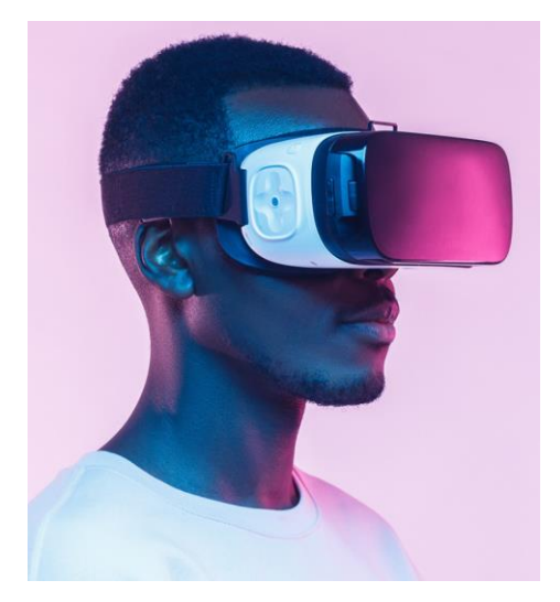
Figure 2: Head-Mounted Display (HMD) (Marchionne, 2019)

Despite its proven benefits, however, there is a lack of research on how to select the appropriate VR tool. Aiming to address this gap, this study focuses on obtaining an answer to "What are the important decision criteria for selecting and investing in a VR tool?". This paper provides a holistic view of VR utilization across industries aiming at identifying and consolidating relevant decision criteria for the selection of appropriate VR solutions. The sole focus of the study is on VR tools that are designed for individual experience via a head-mounted display with audio as is shown in Figure 2. That is the VR tools that allow multiple user interactions in a collaborative virtual environment such as VR based games are not considered.