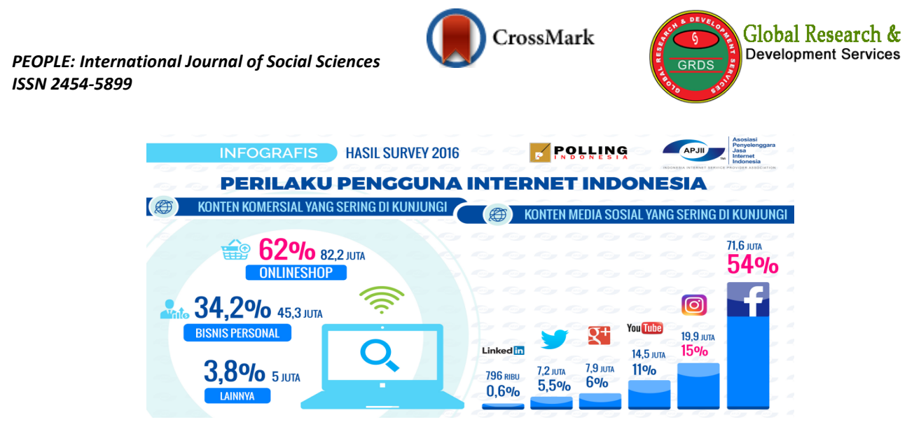
Figure 1 : Statistical Data Internet Indonesia Users

Based on picture above showed that The internet has challenged the dominant role of traditional media, and has gradually been accepted as a reliable source of information among Indonesians. As we can see that facebook app was the most social media that usually used by the citizens.( Statistical Data Internet Indonesia Users, Asosiasi Penyelenggara Jasa Internet Indonesia).