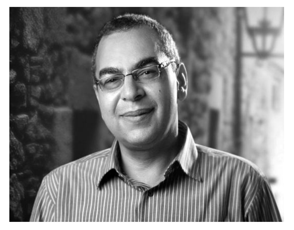
Figure 1: Ahmed Khaled Tawfik

Ahmed Khaled Tawfik Farrag (June 10, 1962 – 2 April 2018) was an Egyptian author and a physician, also known as Ahmed Khaled Tawfek who wrote more than 200 paperbacks, in both Egyptian Arabic and Classical Arabic. He was the first contemporary writer of horror and science fiction in the Arabic speaking world and also the first writer to explore the medical thriller genre.