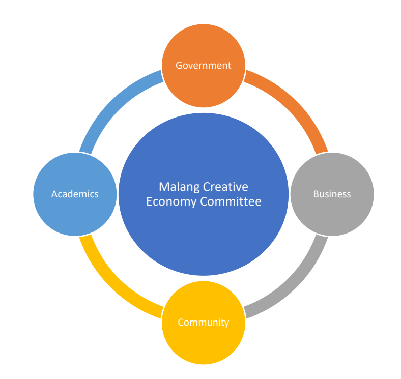
Figure 2: The Quadruple Helix Communication Model in Malang as Creative City

Communication synergy between the government, business, community, and academics are essential in developing Malang as a Creative City. Based on the studies that have been conducted, an analysis can be obtained to strengthen collaboration in realizing the ideal creative city. To generate greater collective power in the Malang Creative Fusion forum, we can take advantage of untapped creativity potentials. This is beneficial for the regeneration and sustainability of the organization. As an organization, Malang Creative Fusion can expand, generate an economy so that the financing does not depend on the government or private institutions