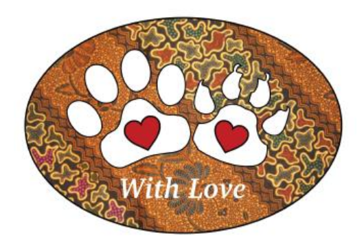
Figure 2: A Logo Design by CCY, Featuring Batik Motif in the Background

Figure 2 features a logo designed by CCY, featuring batik motif in the background. This logo aims to create public awareness about love for animals. The student equates it to the appreciation of batik. GKY's design (Figure 3) aimed at promoting the freedom to practise religion. Inspired by wayangkulit's concept of light and shadow, GKY emphasised that all religions are equal in enlightening our minds. In Figure 4, JY's design is subtly influenced by wayangkulit details such as the light source, a puppet stick that support the puppy carried by the girl and tiny cutout patterns on the girl's dress. The message was that strays are just as precious as the dying art of wayangkulit.