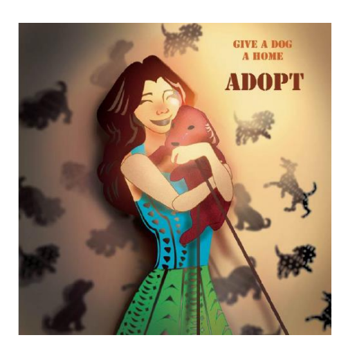
Figure 4: Wayangkulit-Inspired Design by JY