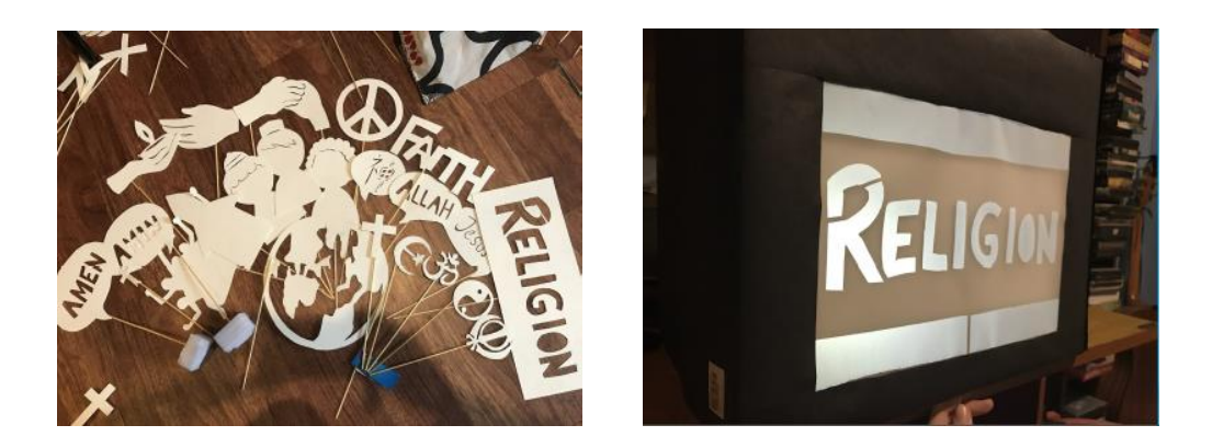
Figure 3: Wayangkulit-Inspired Design by GKY