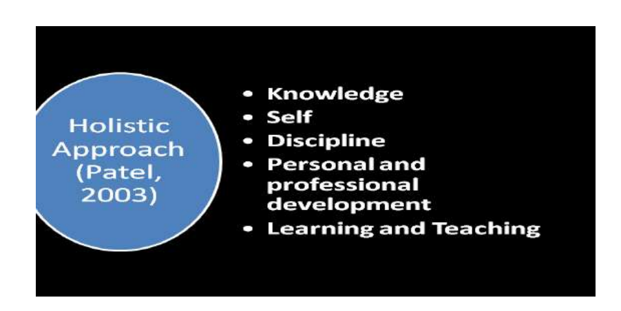
Figure 1: The concept of holistic approach on students' development

The holistic approach covers four outcomes based on the Institute of Learning and Teaching (ILT). Those four outcomes are design and plan a course, teach and support learning in the discipline, assess students' learning achievements, and contribute to the maintenance of student support system (Patel, 2003). These outcomes cover other aspects such as personal and professional development and the development of a community of the knowledge. Further, Patel (1994) argued that the holistic teacher is a learner too. It is because the knowledge has to be discovered by the holistic teacher. Moreover, the holistic approach shows five aspects of learning and teaching interaction (Patel, 2003). The aspects are: knowledge – self – personal and professional development – discipline – learning and teaching.