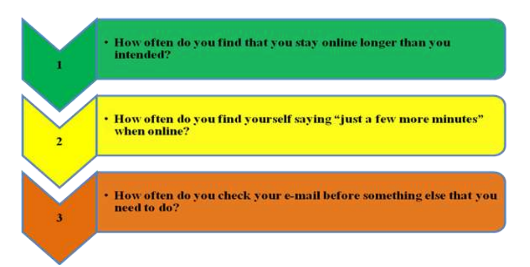
Figure 1: Vertical chevron list on the first 3 ranks of questions on social dimensions

The figure that follows is the first three ranks of questions which the respondents answered correspondingly on social dimensions.