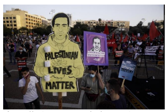
Figure 3: Protesters Attend a Rally Against Israel Plans to Annex Parts of The West Bank in Tel Aviv