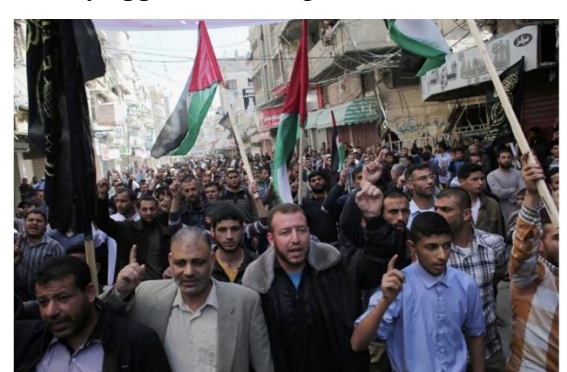
Figure 2: Palestinians are uniting for a General Strike