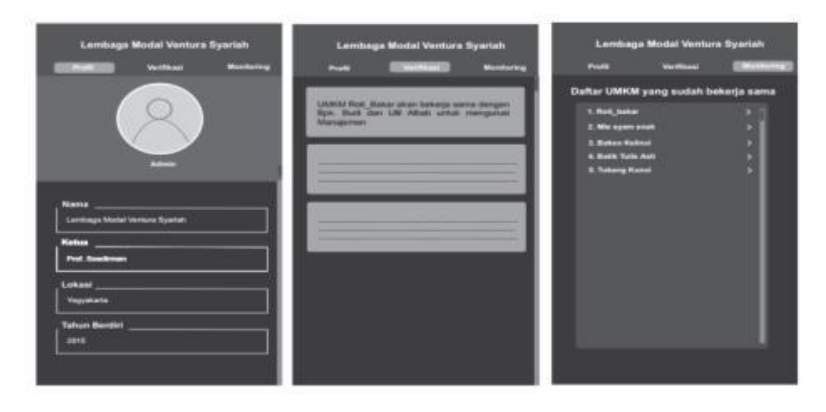
Figure 5: Prototype Sharia Capital Menu