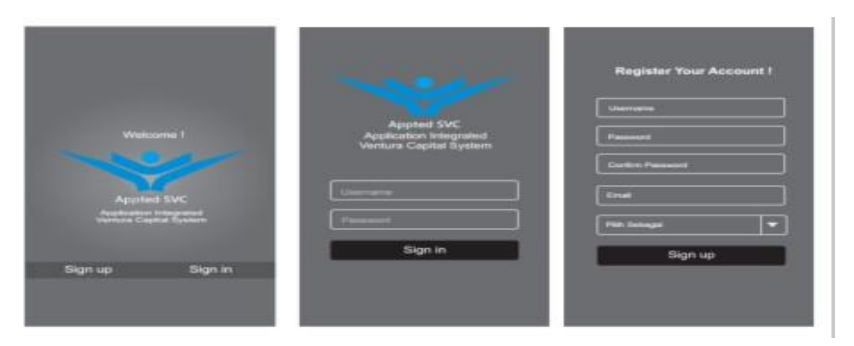
Figure 1: Prototype Main Menu