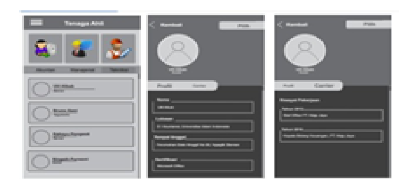
Figure 4: Prototype Engineer Menu