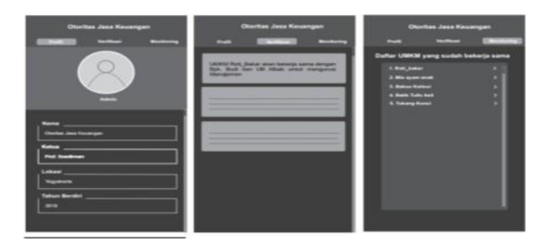
Figure 7: Prototype FSA Menu