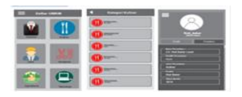
Figure 3: Prototype Register