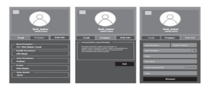
Figure 2: Prototype Menu SMEs