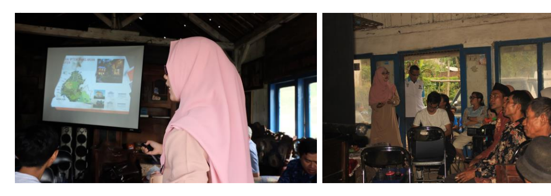
Figure 4: Community Involvement in Three Areas of Community Empowerment

By several discussion result that we conducted in Sumberwangi, we proposed the role of the community in Sumberwangi Hamlet ecotourism development: 1). Formulating the development goal and define the problem, 2). Enabling its residents to understand about the ecotourism development, 3). Reconciling program objectives with community priorities. The local community determines collective needs and priorities, and assumes responsibilities for the decisions.