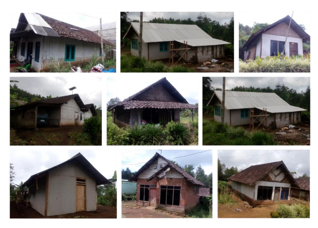
Figure 2: Resident's House Condition at Sumberwangi Hamlet

residents were assisted by the government to reconstruct their houses in a short time. However, the structure and construction of new houses has not yet met the standards of strong wind resistant homes. In addition, with the increasing number of visitors coming to this village for research purposes such as researchers, students and coffee enthusiasts, both local and international visitors, this village needs a place to stay for visitors. Usually visitors stay at residents' homes. Therefore, UB Forest manager and UB researchers make research and community service in designing and structuring lodging houses by utilizing people's houses in order to provide accommodation for visitor while developing the hamlet as ecotourism destination that has tourism attraction complex.