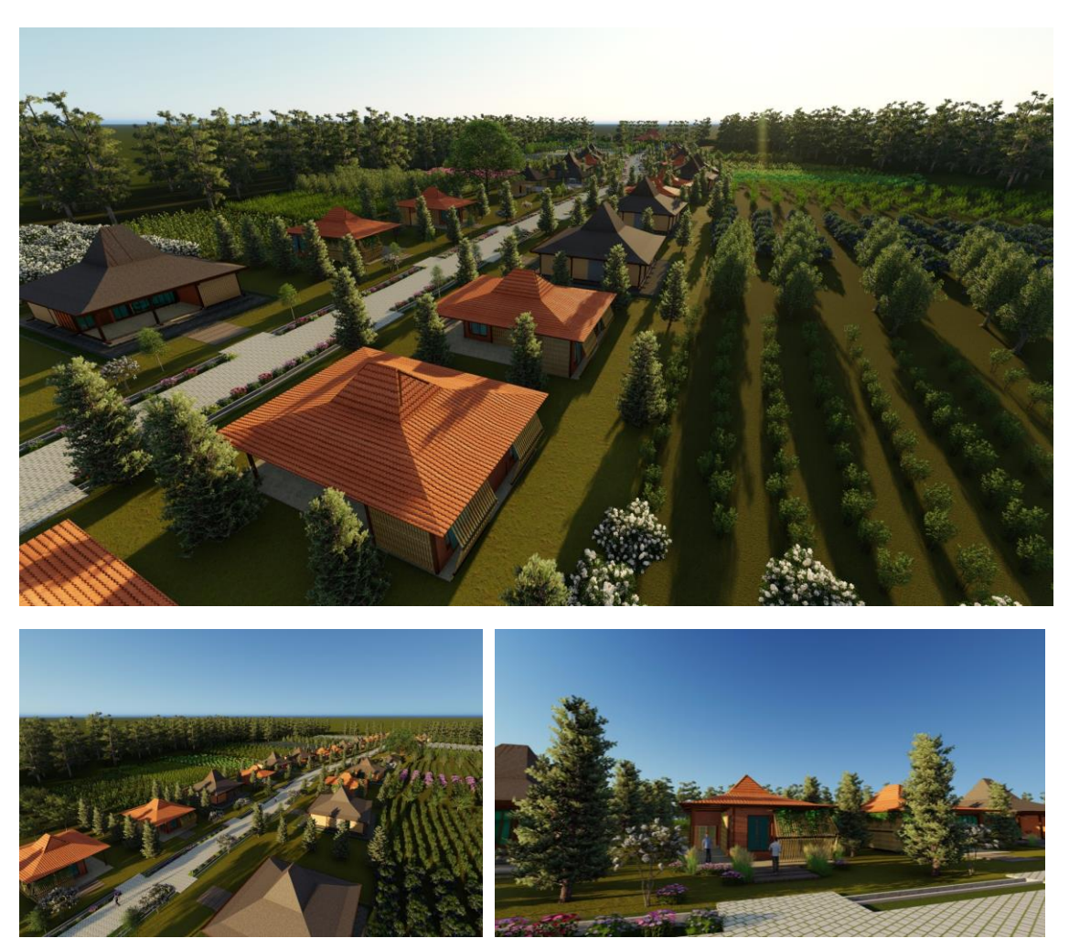
Figure 8: Tourist's Accommodation Design Result

space, hardscape, and softscape arrangement. The community homestay building utilized wind resilience and Javanese traditional architecture concept that implemented in building style, construction, and interior arrangement.