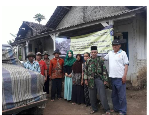
Figure 9: Community Participation in Stakeholder's discussion conducted at Resident's House