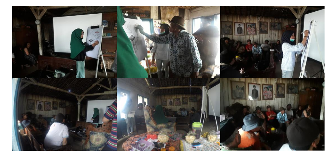
Figure 7: Community Participation in Decision Making Support Conducted at Resident's House

From the result we got about how community participate in Sumberwangi ecotourism development initiation process, the level of local community participation is in participation by consultation. Several meeting and focus group discussion are conducted to get design and development decision. Most residents had little confidence in government support for them to participate in ecotourism.