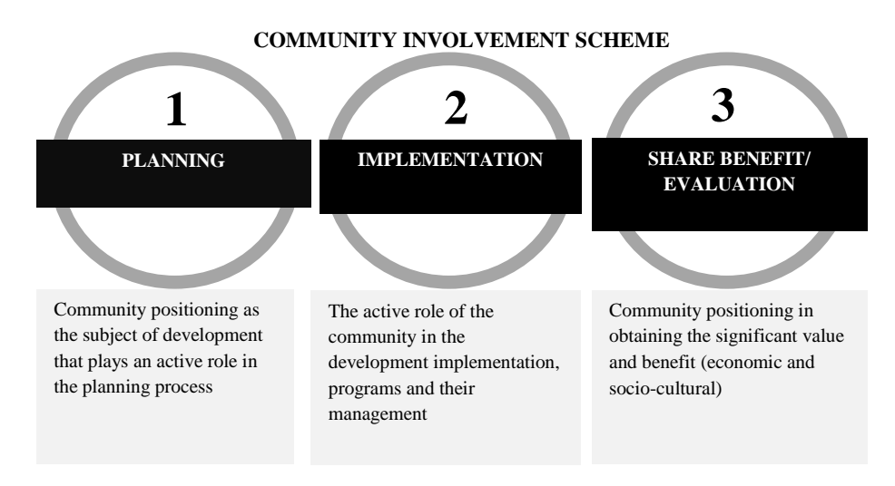
Figure 3: The Area of Community Participation in Ecotourism Development through Empowerment

both individually and collectively. The scheme of community involvement in community empowerment is divided into three important stages: