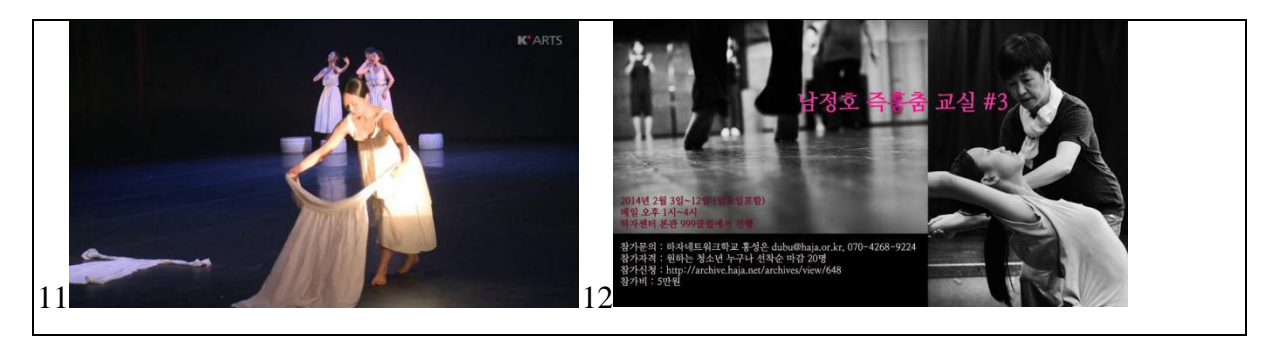
Figure 11: Typical Dancing Work "Washing"

aesthetics on the society such as colonization by Japan, South-North War, the stationing of American troops...which have changed the tradition of Korean dances. Besides, she has also argued that Korean people returned from a study abroad and refreshed their reflection on the traditional culture. Therefore, following the concept, she has taught in the university and external teaching workshop (see Figure 12) with an aim to stimulate the reflection of dancers on the history and society and written a research monograph on dance creation and choreography, Imagination of the Body (몸의상상력) (see Figure 13). In the book, employing the body discipline theory of Foucault, she mentioned the relationship between body and society, clearly interpreted the three concepts, i.e., the contemporary nature of Korean dances, contemporary traditional Korean dances and contemporary Korean dances. The creation of contemporary traditional Korean dances is directly associated with the "faith". However, the elaboration of Professor Nam on the association of "Shamanism, Dharma wheel, body and creation" is not deep enough, but only touches upon the return of imagination, which needs to return from a logic of thinking. This recognition has supported the legality to a certain extent for the current topic.