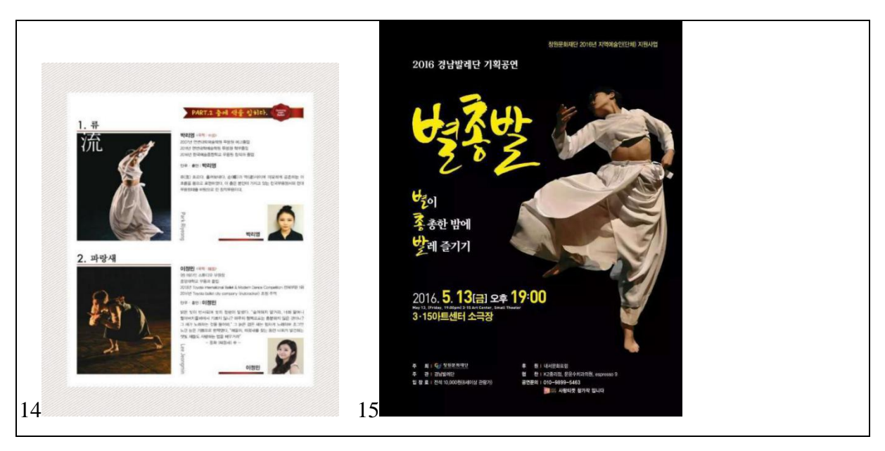
Figure 14: Text of the performance programs of "Flow" Figure 15: Publicity poster based on the main image of "Flow"

From what has been mentioned above, we know it indicates that the contemporary Koreans believe that there is a close relationship between the traditional dances of Korea and the faith of Shamanism. In spite of the reform and influence of social system and historical factors, Korean traditional dances still maintain a traditional origin. For example, the faith of Shamanism indicates that through various rituals of Shamanism, people can communicate with all creatures in the world to fulfill their purposes such as divination, medical treatment and asking about the weather. In fact however different the style of dances is, we have never got away from the performance feelings from "faith" when we feel the forms in traditional dances of Korea from their external forms. Another example, in a ceremony of Shamanism, people communicate with deities in the faith of Shamanism through a series of primitive dances, including gestures, songs and dedicated devices. Through production of costumes and facial masks, the spectacular scene is decorated to achieve a strong and shocking effect. This law has always been maintained in the contemporary creation of traditional dances. In fact, this is also an extension of the recognition of "established rules" or "creation rules" mentioned in the introduction part.