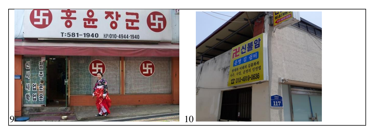
Figure 9: Female Mou-dang on the way to work at the workplace