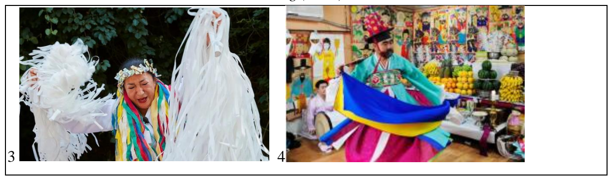
Figure 3: Female Mou-dang is "Drawing Amulet" Figure 4: A Male Pa-suk is "Rotating to Dispel Evil Spirit"

(Fig. 1 to 4 are provided by Professor Nam Jo-ho (남정호/南贞镐). Source of data: The Art Information Library of Korea National University of Arts, 2015)