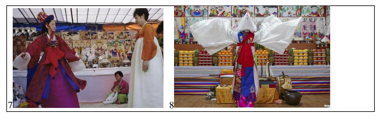
Figure 7: Female Mou-dang is listening to the praying of common people

Figure 7 to 8 show Mou-dang is listening to the praying of the people and considering their relationship with the deities by analyzing their praying. This function and characteristic of assistance highlights a shift from early "dancing for deities" to "dancing for the people". Most scholars argue that the shift has originated from the change law of Shamanism itself, such as the reason for the shifting from Buddhist deities to Taoist deities and then to the deities in the historical development of Korea. But what remains unchanged is that they have observed the differentiation of deities in different systems. On the other hand, it originates from the communication between political system and the life of common people in society, which is just like a change of aesthetics. Shifting from an era to another, what has remained unchanged is the core spirit in the differentiation of systems.