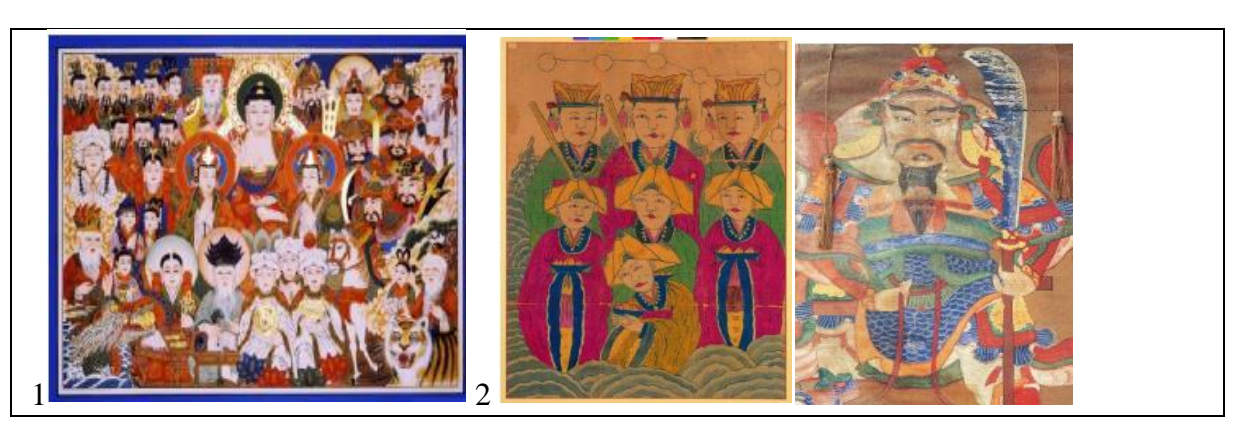
Figure 1: Shamanism deities (also called "painting of six major deities")